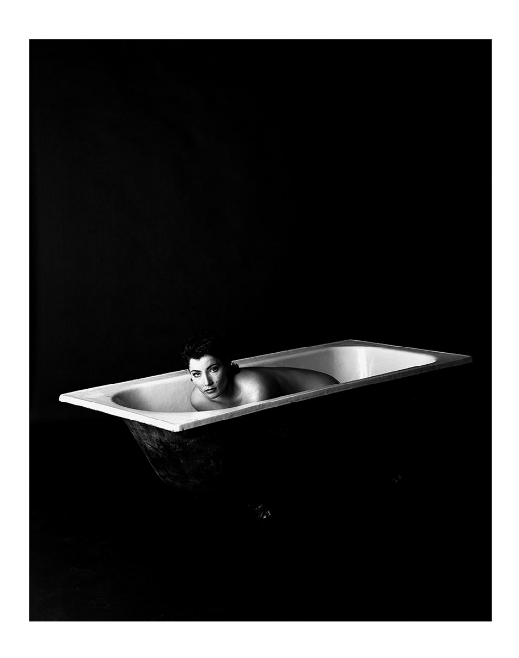
Bath By Caterina Pacialeo

Photograph - Woman Series - Ed. 3/10 + 1 A/P(NFS) - Black & White Fibre Base Exhibition Print on Warm Tone Paper - H61cm x L51cm - A$1400