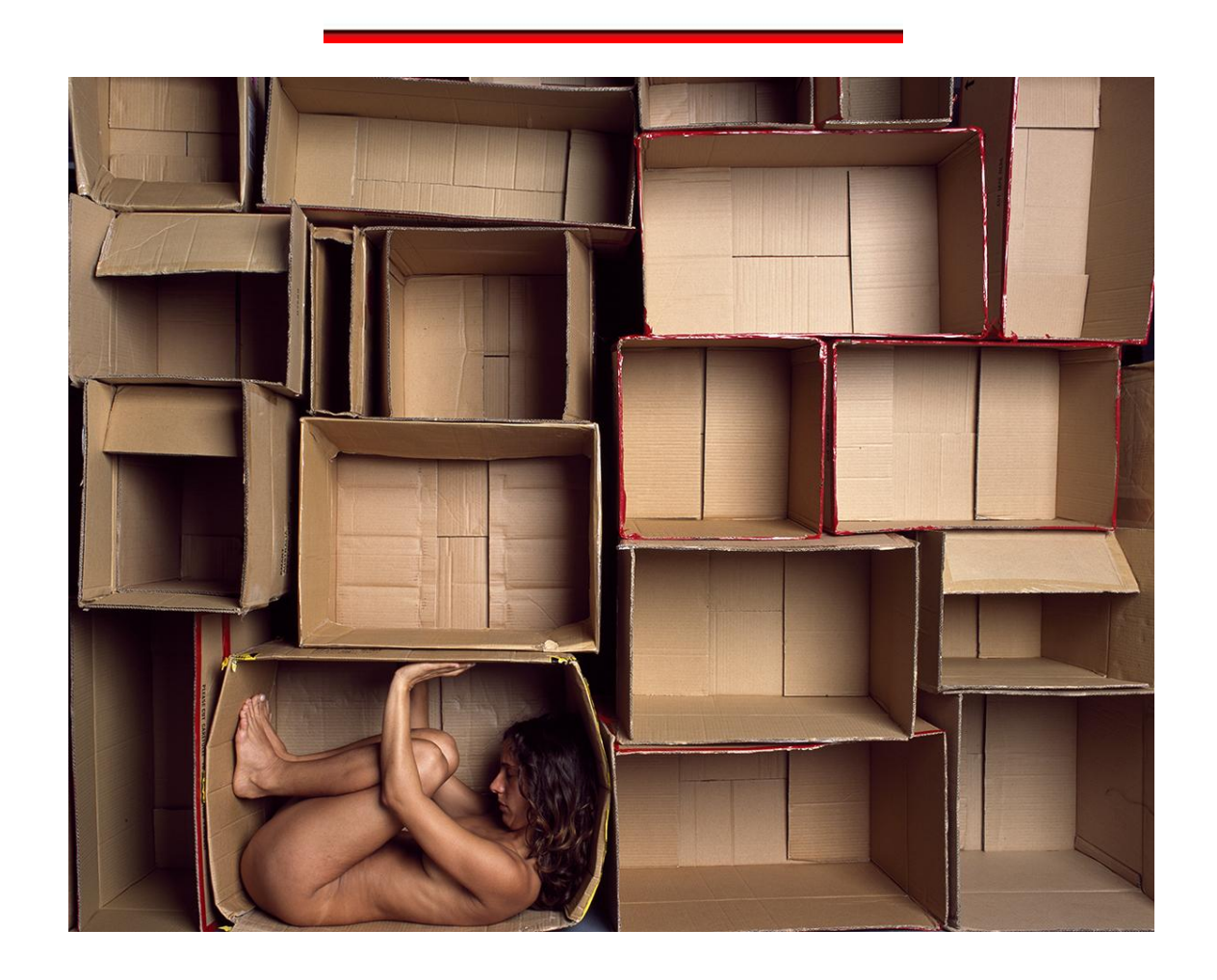
Box By Caterina Pacialeo